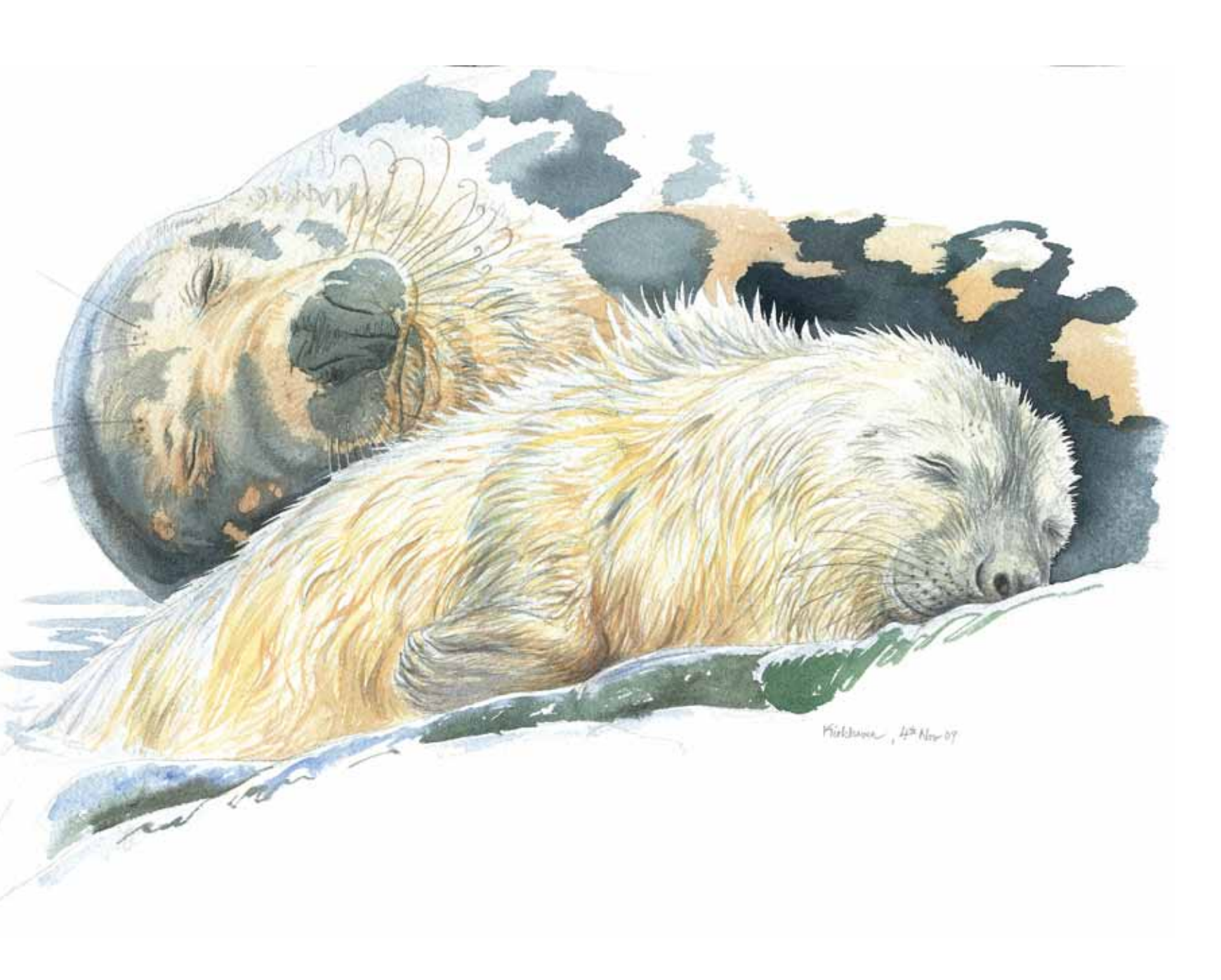
4 November 2009. This young pup with wet fur, along-side its mother on the rocks just by Kirkhaven pier, spent a lot of time swimming with her at high tide from day one. In contrast most pups try to keep out of the water if they can avoid it.

Wet seal pup, Pencil & Watercolour, 38 x 27 cms