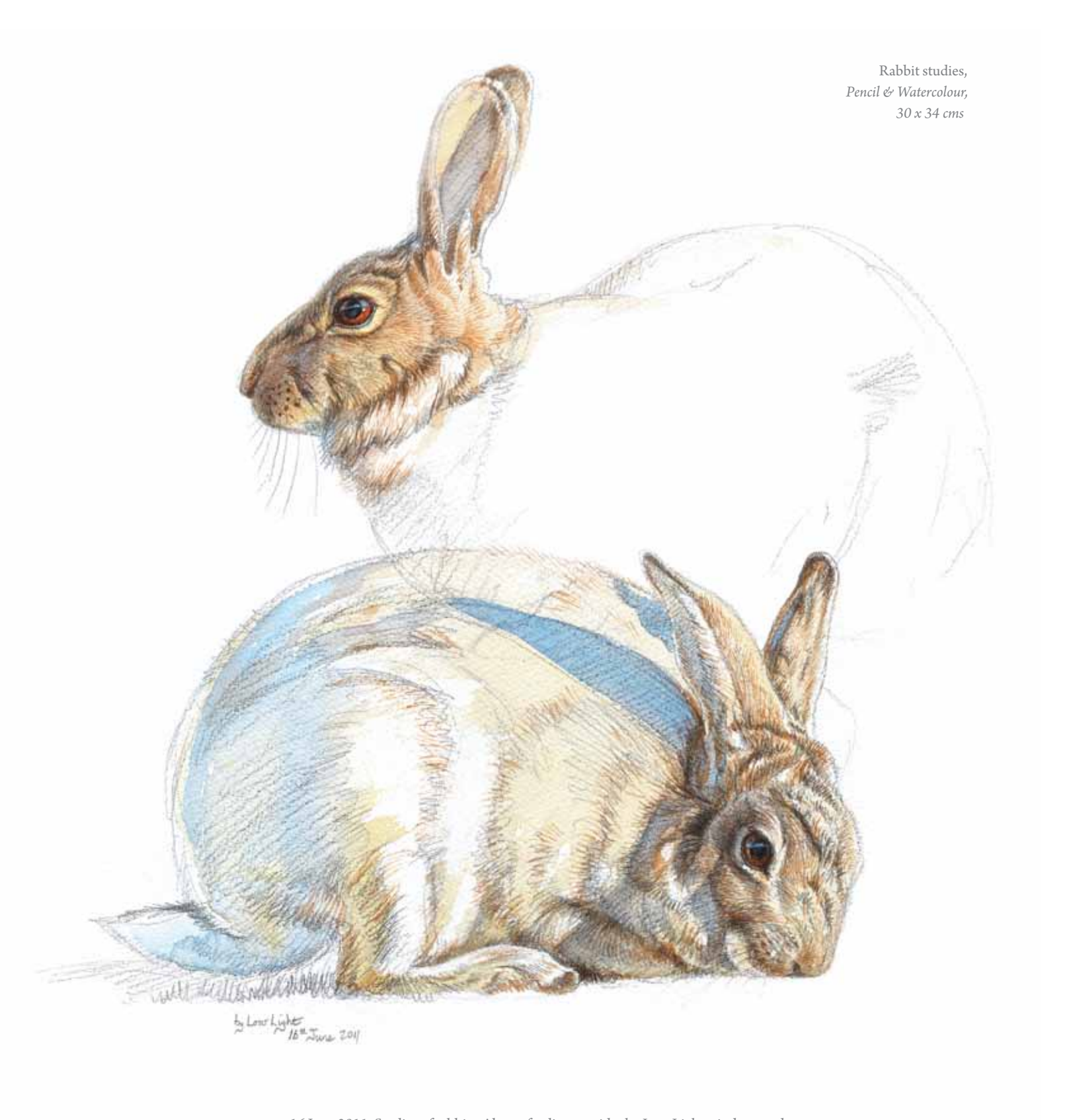
16 June 2011. Studies of rabbits. Above, feeding outside the Low Light window; and, opposite, sunning themselves on the slopes nearby. Most of the adult rabbits are still casting their winter coats – no doubt due to the cold early summer weather. They have been in very large number over the past two years, which has meant a dearth of thrift in flower. Luckily they don't seem to like the ubiquitous sea campion.