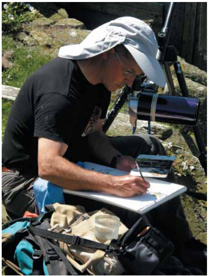
Opposite: Razorbill shielding a chick, Watercolour, 31 x 45 cms