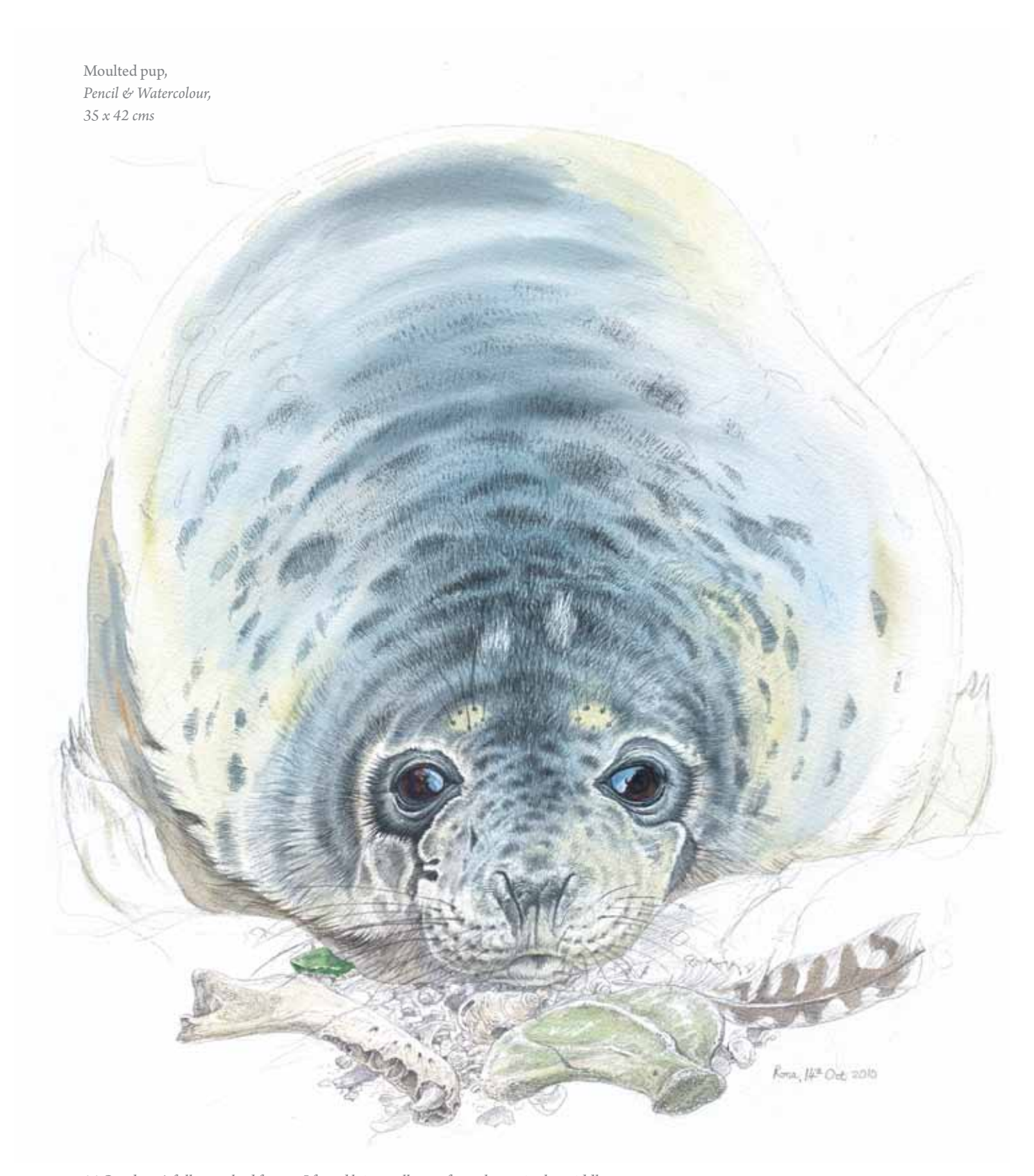
14 October. A fully moulted fat pup I found lying well away from the sea in the middle of Rona. It must have been born around 23 September, the earliest pup on the island in 2010. I approached the pup quietly and sat only a metre away to sketch it. It has typical wet patches around the eyes. Amongst the shell and other debris are the lower jawbone and scapula from a pup casualty in a previous year.