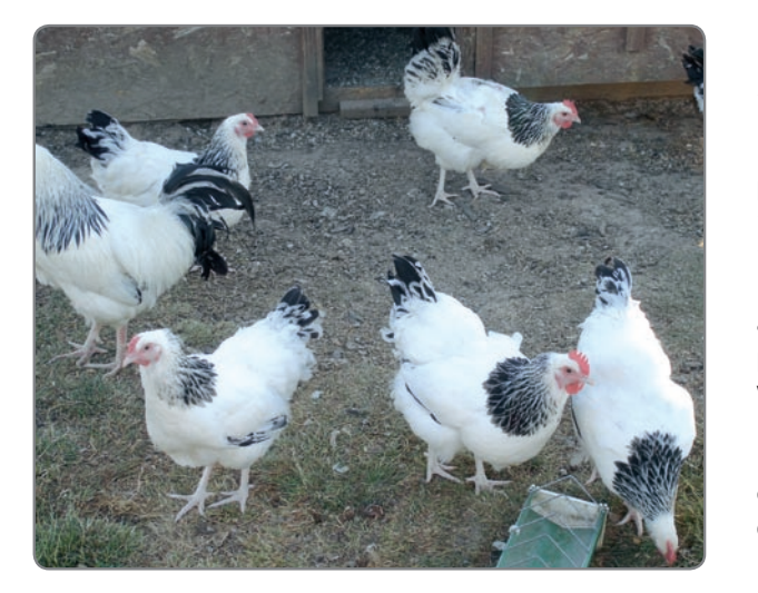
Above: Free range gives a much better texture to the flesh of table birds.

unless you're prepared to do this humanely and properly then this is not the option for you.